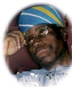
Chief Bola Ige in a Pensive Mood

The Attorney-General and Minister of Justice, Chief Bola Ige, has been elected to take a seat on the United Nations International Law Commission in New York. Members of the Commission are elected by