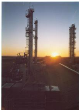
A Typical Gas Plant

A trans-Sahara gas pipeline project between Nigeria and Algeria is being fashioned out. High-level negotiations between the officials of the two countries and the World Bank have commenced. The project will