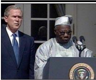
President Olusegun Obasanjo and President George W. Bush.

President Olusegun Obasanjo presenting an address during his visit to Washington.