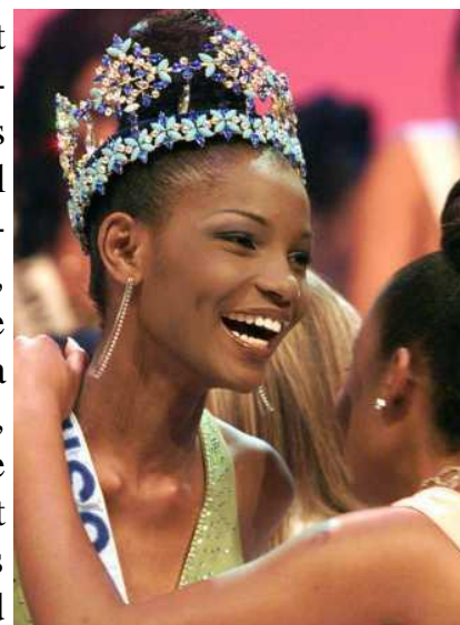
New Miss World Being Congratulated.

to raise money for less privileged children all over the world so that they can have a better future.