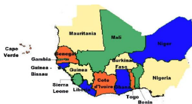
Economic Community of West African States (ECOWAS)

Part of a fast track programme initiated by President Olusegun Obasanjo to forge integration among the people of the Continent by fostering smoother economic relations by the different governments, has been realised with the establishment of a free trade zone by Nigeria and six other West African countries. The countries in